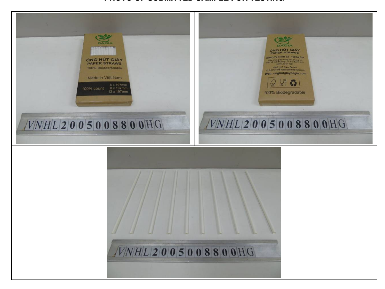
REPORT RESULTS REFER TO SUBMITTED SAMPLE (S) ONLY ***End of Report***